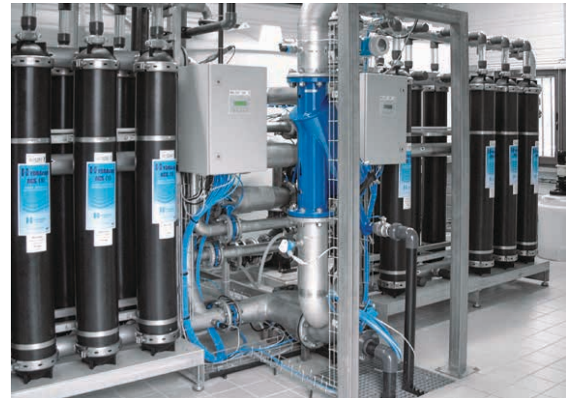
Above: Turnkey automated membrane filtration unit on skids enable Festo to rapidly deploy autonomous and reliable water treatment solutions.