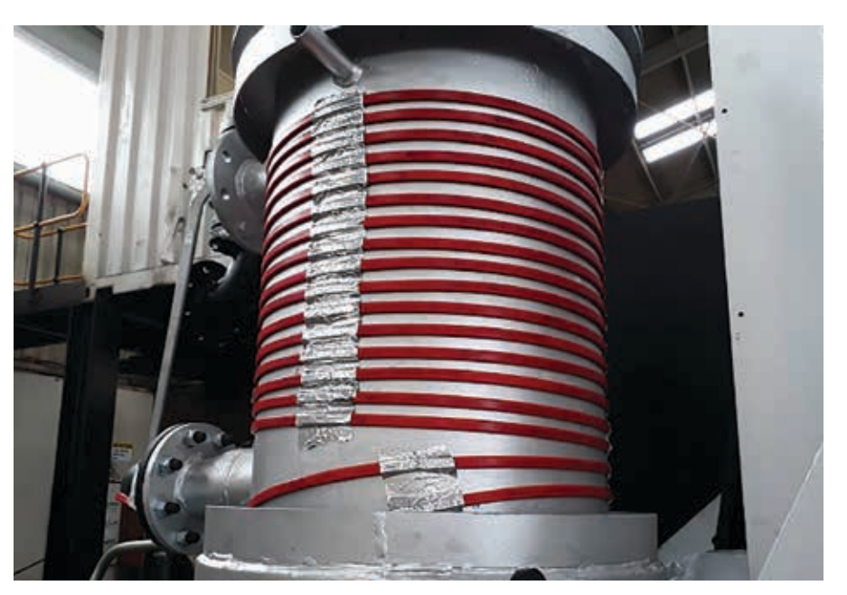
EHT lowers the viscosity of many processes as it acts as a compensating heat source to maintain or raise the heat in nines tanks surfaces and other vessels

Heat tracing can also provide significant cost reductions and energy conservation as it regulates temperature ensuring that during uncharacteristically cold days, other costly sources such as flange or gas heater don't