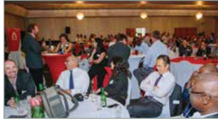
Guests at 2017 Best Projects Awards function.

Best Project Awards special issue Associate your brand with excellence in construction